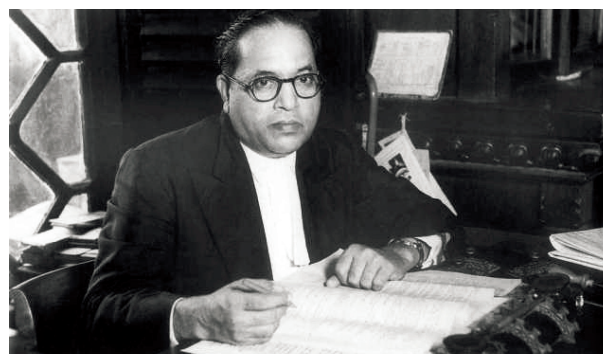
Dr. B.R. Ambedkar

Dr. Sachchidananda Sinha, the oldest member, was elected as the temporary President of the Assembly. While the work was in progress, Dr. Sahchidananda Sinha died. Dr. Rajendra Prasad was elected as the President of the Assembly. Similarly, both H.C. Mukherjee and V.T. Krishnamachari were elected as the Vice-Presidents of the Assembly. The Assembly met for 11 sessions along with 166 days of meetings. During the discussion, 2473 amendments were presented. Some of them were accepted. The Assembly worked through various committees and the draft of the Constitution was prepared by the Drafting Committee under the chairmanship of Dr. B.R. Ambedkar. He is recognised as the 'Father of the Constitution of India'.